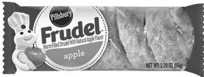
Pillsbury™ Frozen Frudel™ Apple 2.29 oz