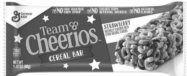
Team Cheerios™ Cereal Bars (96 ct) 1.42 oz